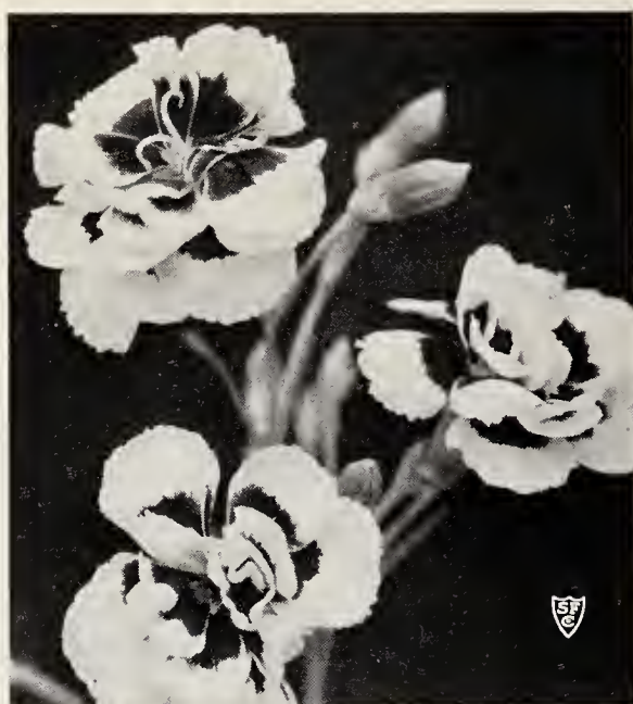
DIANTHUS, WHITE MAROON

DIANTHUS, WHITE MAROON —Unusual form of feather pinks of spicy fragrance and lasting flowers with color of deep maroon, nearly black center framed by white edged petals. Easily grown dwarf form of pink for the hardy border or rockery. Makes a splendid, fragrant table flower when cut. First time offered. 35c each, 3 for $1.00.